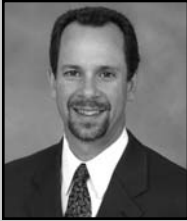
Kyle Kallander Commissioner